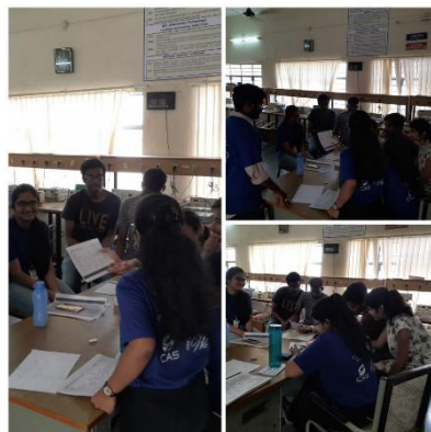
Participants in Crypto hunt

Round 2: It involves an exciting quiz with multiple-choice questions.